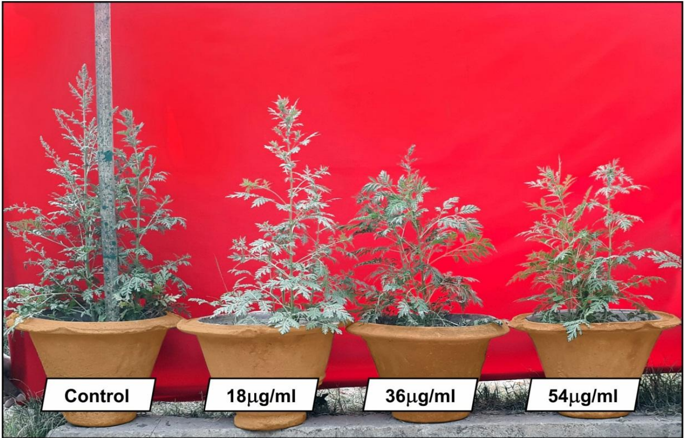
Figure1 : Showing effect of Copper Nanoparticle on the plant of Artemisia annua L.